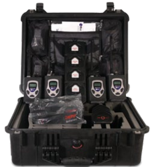
BioHarness Team Kit