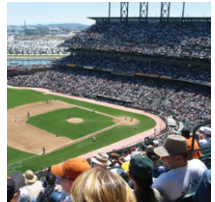
ProRAE Guardian is ideal for threat monitoring and detection of large-scale public venues