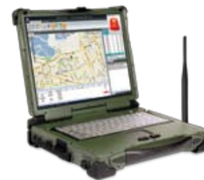
RDK Ruggedized Host