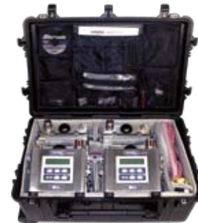
RDK Detector Kit