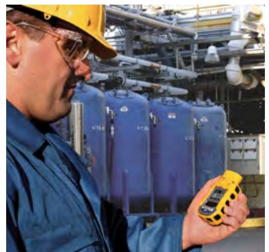
Worker exposure monitoring with ToxiRAE Pro PID at a PVC plant